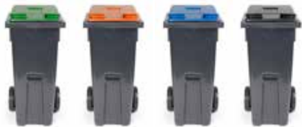
Outside bins for recycling.